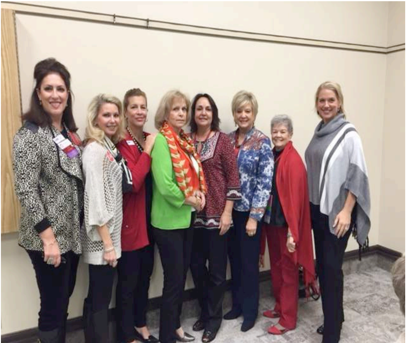
ARW Members at the TFRW Convention in Lubbock TX