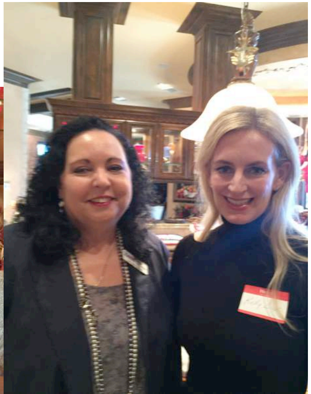
ARW Members Enjoying the ARW Celebration!