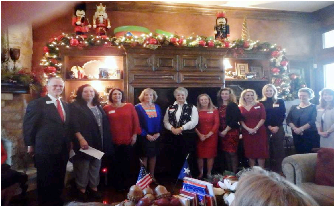
The 2016 ARW Officers

Onwards to VICTORY in 2016 and the Merriest of Christmas and a Happy 2016 to all!