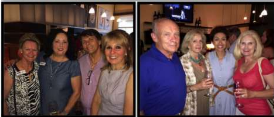
July Summer Social